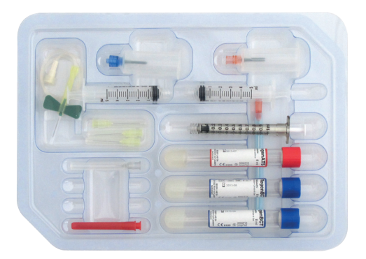
RegenACR Plus C € 0123

WARNING: Due to the risk for the vessels, avoid eye lids, be cautious on the glabella area, no injection in the internal eye's angle.