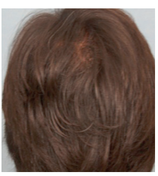
AFTER 3 TREATMENTS WITH RegenACR classic & Extra