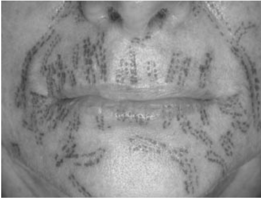
Fig. 3. Appearance of a typical patient immediately after undergoing to dermabrasion with voltaic arc technique.