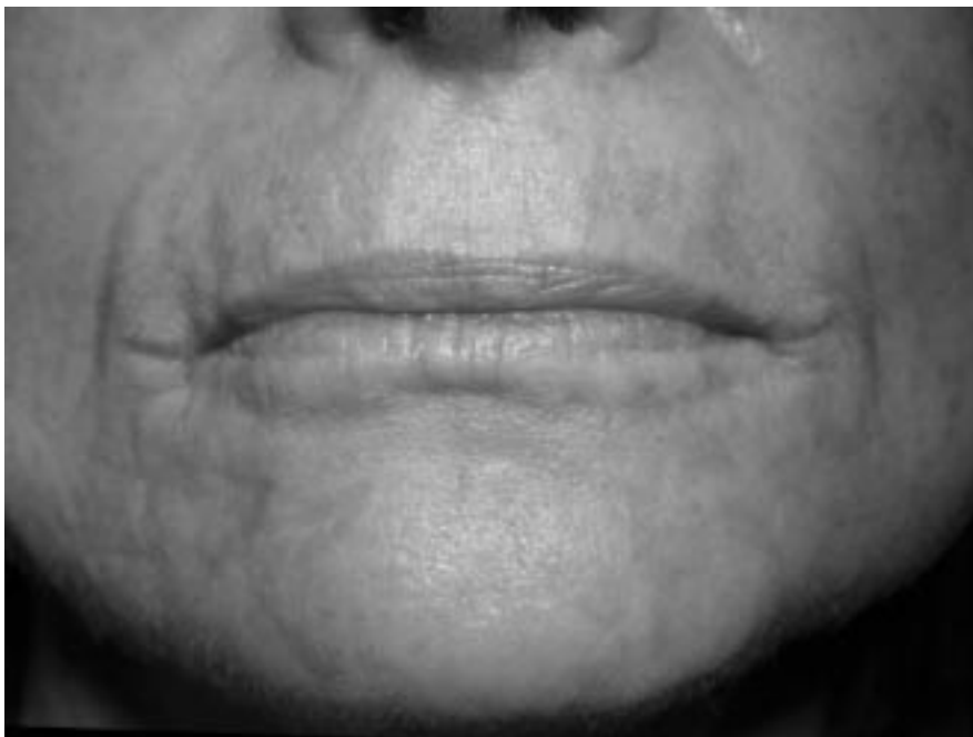
Fig. 4. Postoperative photograph of a patient after 1 month treatment resulted in a better cosmetic outcome

electro-dermabrasion are experience and understanding of its principles to provide sufficient resurfacing to the appropriate depth and minimize scar formation. Careful patient screening is crucial to ensure realistic expectations.