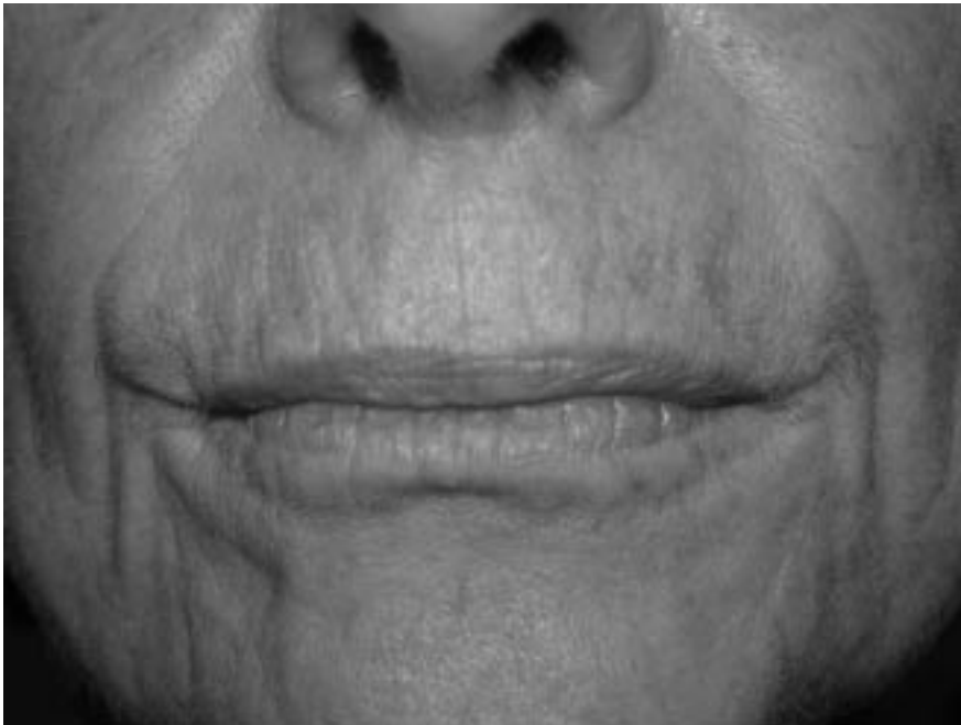
Fig. 2. Before treatment of perioral rhytids.

dermis, which enhances the tensile strength of the skin and yields the clinical appearance of rejuvenation. Ablative resurfacing achieves the outcome of rejuvenation by the destruction of the outermost and thus most photodamaged layers of the skin. The subsequent laying down of newly